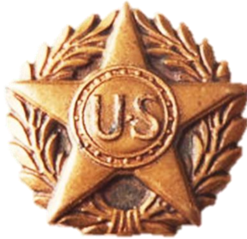
Honorable Discharge emblem World War I